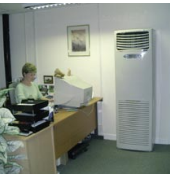
Crestair fan coils use little floor space whilst achieving high volumes of airconditioning