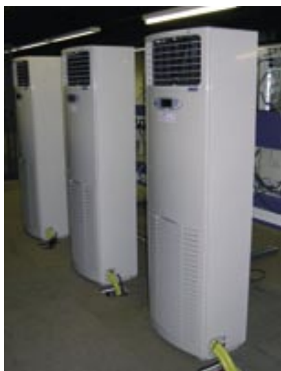
A Crestair system maintaining safe working temperatures in a server room